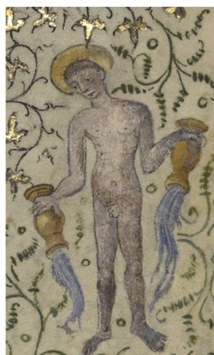
Top left: Aquarius represented in an illuminated calendar page, dated 1402.